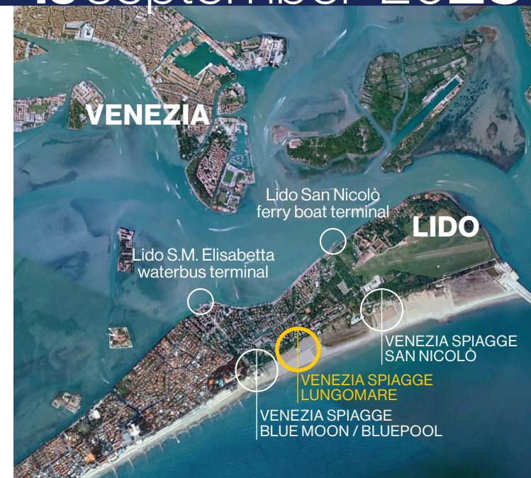
The map is indicative, any variation will be decided in an unquestionable manner by Venezia Spiagge